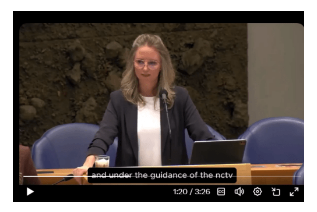
Watch on X