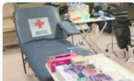
American Red Cross calls for donors, faces