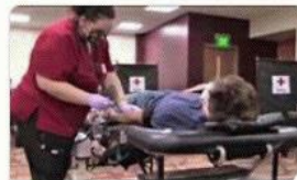
Red Cross urges public to donate blood due to flu

Speaking personally, I would greatly prefer and pay what I can afford for a transfusion of unvaccinated blood if I needed one. Our previous concerns about vaccine shedding have proven true, and blood could be another shedding vector.