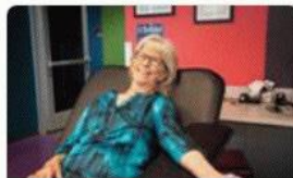
28 gallons — Mesquite blood donor helping to