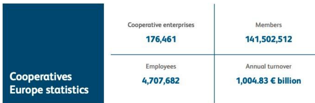
Photo 2. - Cooperatives Europe statistics 2

This is why cooperatives have been recognized as key partners for achieving the Sustainable Development Goals (SDGs). Their unique position in transforming lives through democracy, education and self-help puts people and communities in charge of their own livelihoods.