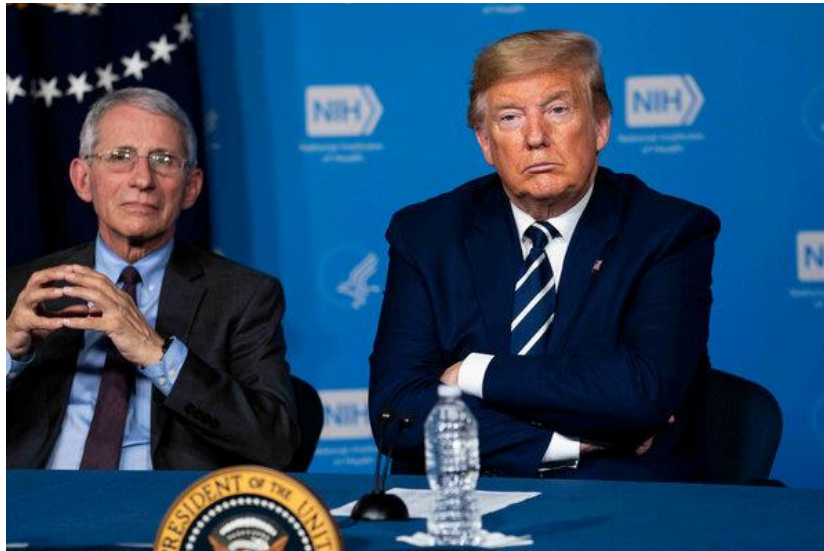
Fauci with President Donald Trump at the Vaccine Research Center in Bethesda, Md., on March 3, 2020.