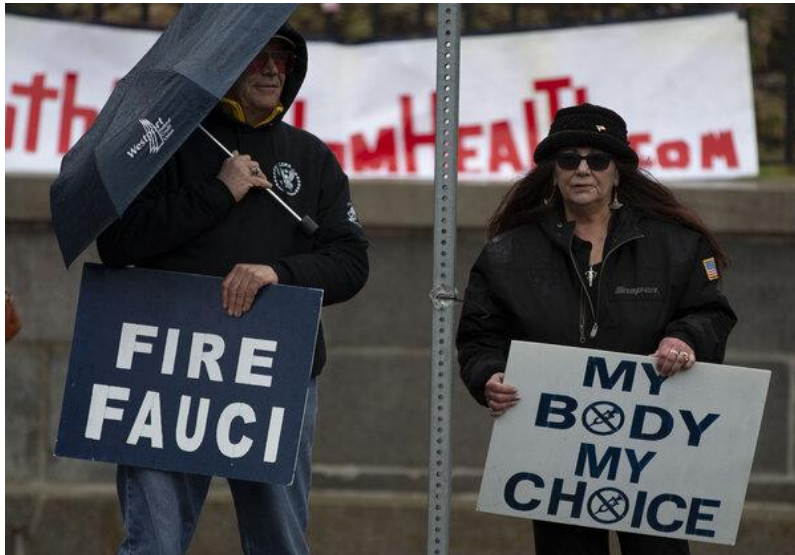
Protesters outside the Massachusetts Statehouse on Jan. 5, 2022, demanding an end to vaccine mandates.